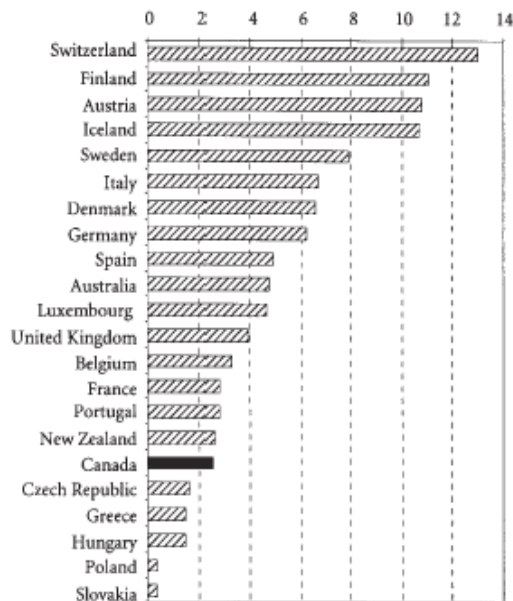
Executive Summary Chart 2: MRI Machines Per Million Population in the OECD*

*Figure does not include Japan, which has an inordinately high number of MRI machines and CT scanners.